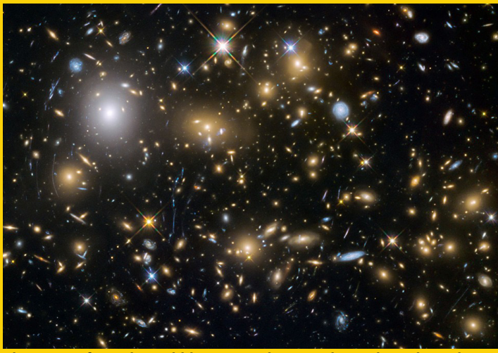
This image from the Hubble Space Telescope shows the galaxy cluster MACSJ0717.5+3745, one of the most massive galaxy clusters known.

By measuring how fast galaxies rotate and how fast the galaxies in galaxy clusters move, we can figure out the mass of the galaxies or clusters: the total amount of matter they contain. If we compare this total amount to the total mass of the stars and gas in the galaxies or clusters of galaxies, we find that the normal matter we can see accounts for only a few percent of the total mass. The rest of the mass is what we call dark matter: we can detect it because of its gravitational effects on the stars we can see, but it's completely invisible. What is it? We don't know! Our best guess is some kind of very small particle, but the nature of dark matter is one of the big unsolved questions in astrophysics.