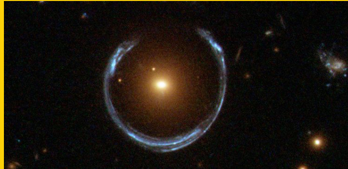
Another result of General Relativity is that curved spacetime forces light to bend, much as matter moves in curved trajectories. This image is of a background galaxy (blue ring) magnified and distorted by the gravitational field of the dark matter in the foreground galaxy (red).

Observations have discovered a black hole with mass equivalent to 4,000,000 Suns at the center of the Milky Way galaxy, with much larger black holes present in many other galaxies. These black holes accelerate gas to very near the speed of light and eject that gasto distances of thousands of light years out of the galaxies.